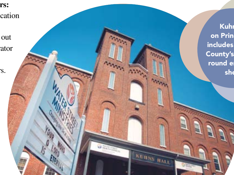
Kuhns Hall on Prince Street includes Lancaster County’s only year-round emergency shelter.

StoudtAdvisors is proud to support Water Street Ministries. For information or to get involved, visit waterstreetministries.org .